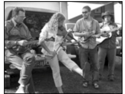
local musicians enjoy a jam session

At least two bands in this year's line-up had drummers! Good drummers (those two words are not necessarily mutually exclusive)! Folk-rock has arrived on